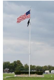
Flag at WP/AFB

Day 2: We boarded a bus at 9AM for the 50+ mile trip to Wright Patterson Air Force Base and Air Museum. The day was overcast and chilly but never really let loose with rain. The museum was interesting and showcased the history of flight from the Wright Brothers (for which the AFB is named) to current day flight and aerospace. Upon return we had the opportunity to just relax and converse with our buddies.