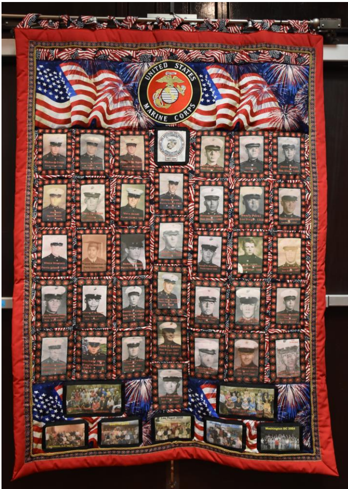
Irma's Beautiful "Memory Quilt"