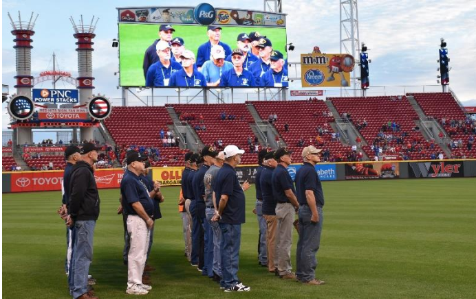
Golf 2/5 Marines Being Honored at Red Stadium—What an Honor! Thank You Cincinnati!!

I was particularly blown away at the Reds game—before the game started, all Golf 2/5 Marines were called out to the field and the announcer introduced our Veterans organization and highlighted many 5 th Marines achievements throughout Marine Corps history including Vietnam while photos of Vietnam were dis-