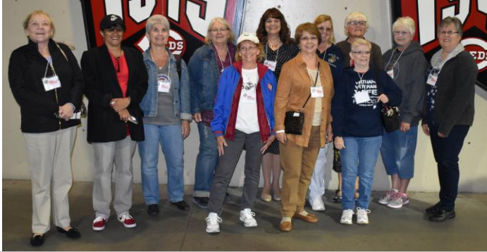
Golf 2/5 Ladies at the Reds Game

It was a lot of preparation, but also a journey of discovering what it really means to be a former Marine's wife. I understand better the deep friendships bonded many years ago after being thrown together into a foreign country; very different from anything these young men have ever endured; then learning to live and survive together. The closeness these men share can never be