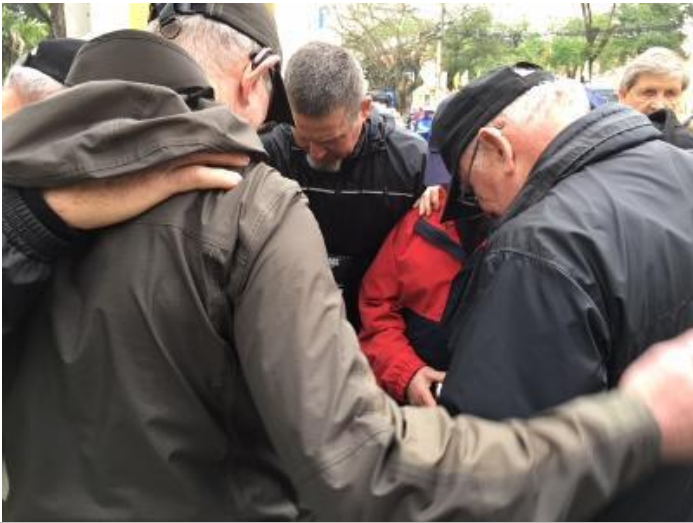
In Hué Saying a Prayer for our Fallen Marine Brothers

The odyssey this time for me was a time to say goodbye to Marines that weren't as fortunate as me to still be here, goodbyes that 50 years ago we were not able to do. People talk about closure and healing. I don't know if these are achievable or if we really want to toss those memories aside. I have a better understanding today of the enormous task that was heaped upon us. As arduous as it was doing it then only magnified it now for me and I was damn proud to walk it again with my brothers at a time and point in my life where it was necessary.