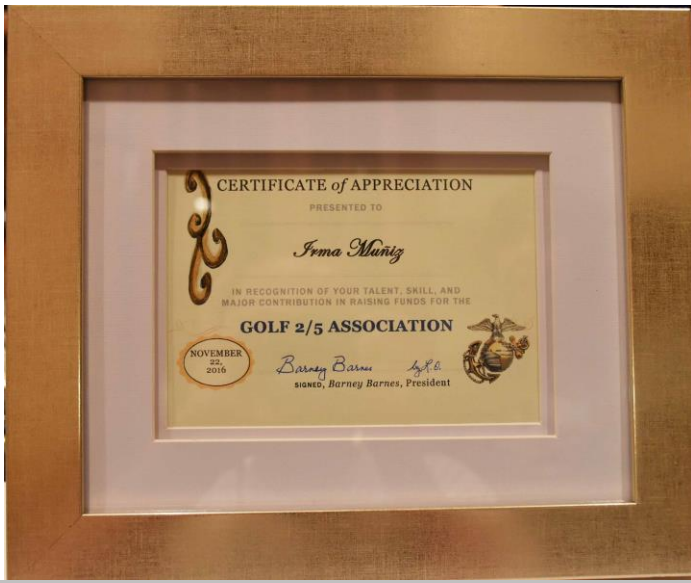
Certificate of Appreciation sent with her gift